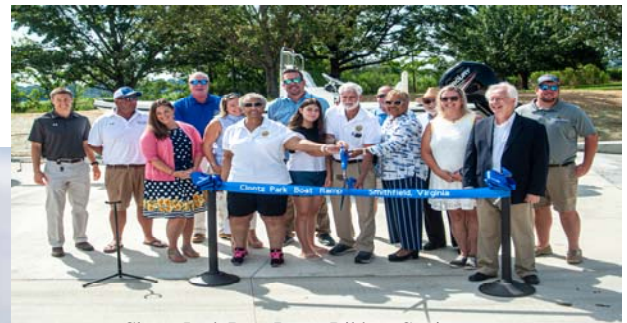
Clontz Park Boat Ramp Ribbon Cutting