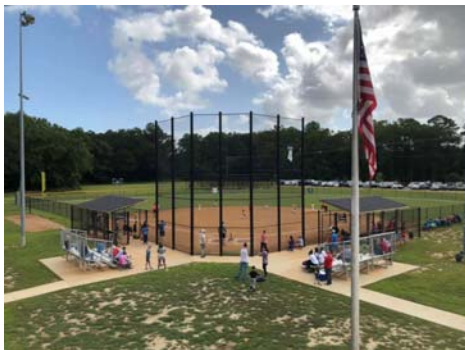
Game Day at the Joseph W. Luter, Jr. Sports Complex

Below are a few photos of completed or near completed projects.