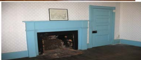
Restoration of Windsor Castle Manor House